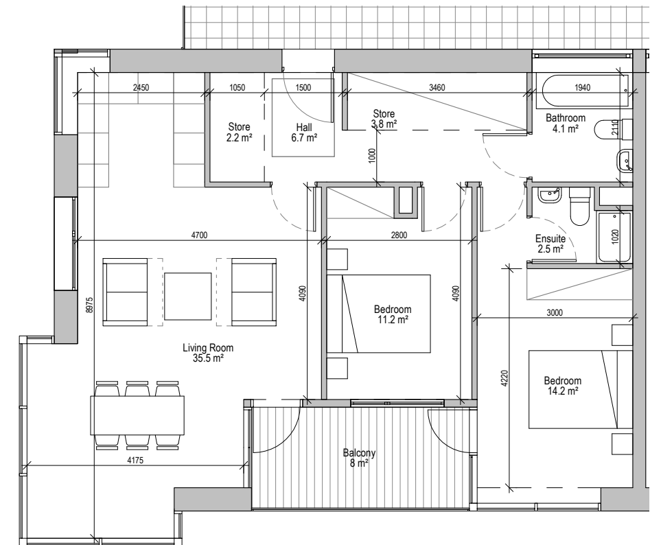
③ AT10a 3 BED 83.2 SQM 1 : 100